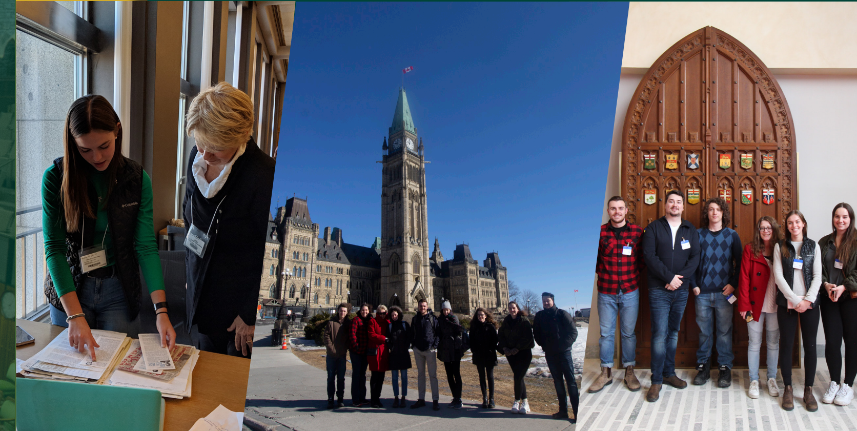
History students undertake research for their Hate Speech Class at Library and Archives Canada in Ottawa